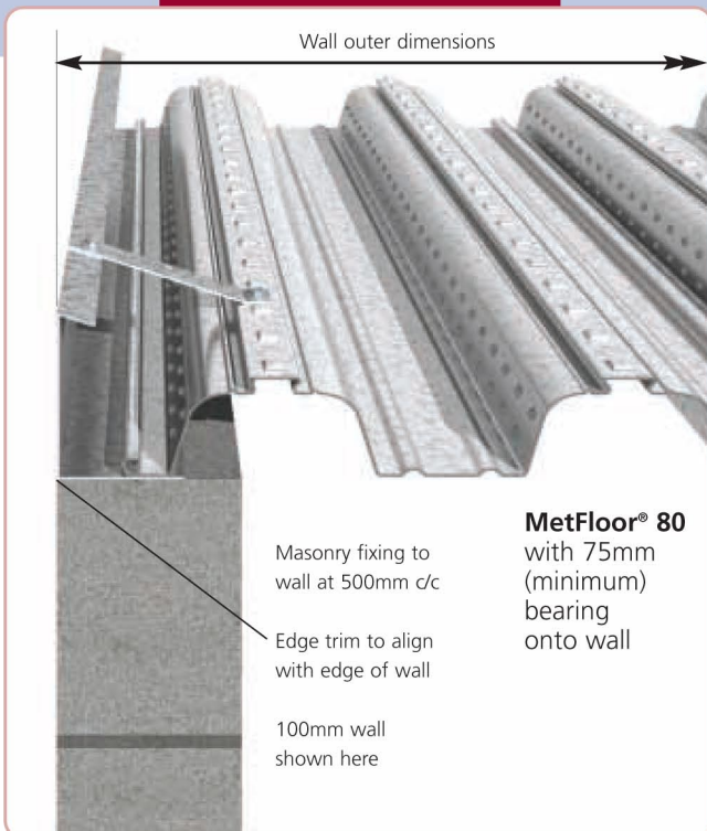
Typical wall side detail